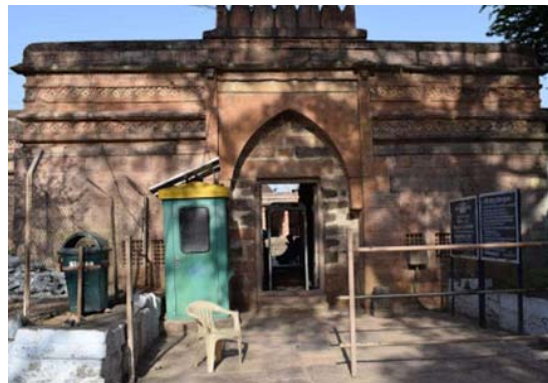
Bhojshala, Dhar, Madhya Pradesh