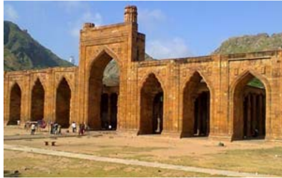
Dhai Din Ka Jhonpra, Ajmer

in Delhi and later Bhojsala Temple at Dhar in Madhya Pradesh. Although some hardcore Hindus resent this fact and many times try to make some hue and cry but this contestation did not create a major problem till date because the sites are not associated with popular Hindu gods like Lord Rama, Krishna or Shiva.