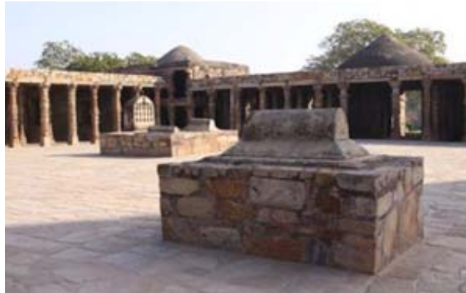
Quwwat Ul Islam Mosque, Delhi

As cited above, there are two types of contestations. One, so far as early Islamic invasions are concerned, there were Hindu temples destroyed and mosques built in the same site with the spoils of the destroyed temple and the best examples are Dhai din ka Jhonpra at Ajmer in Rajasthan, Quwwat ul Islam mosque